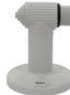
Threaded Wall Mount