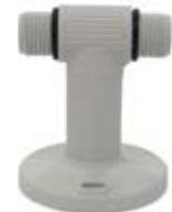
Double Threaded Wall Mount