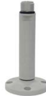
Footring with Extension